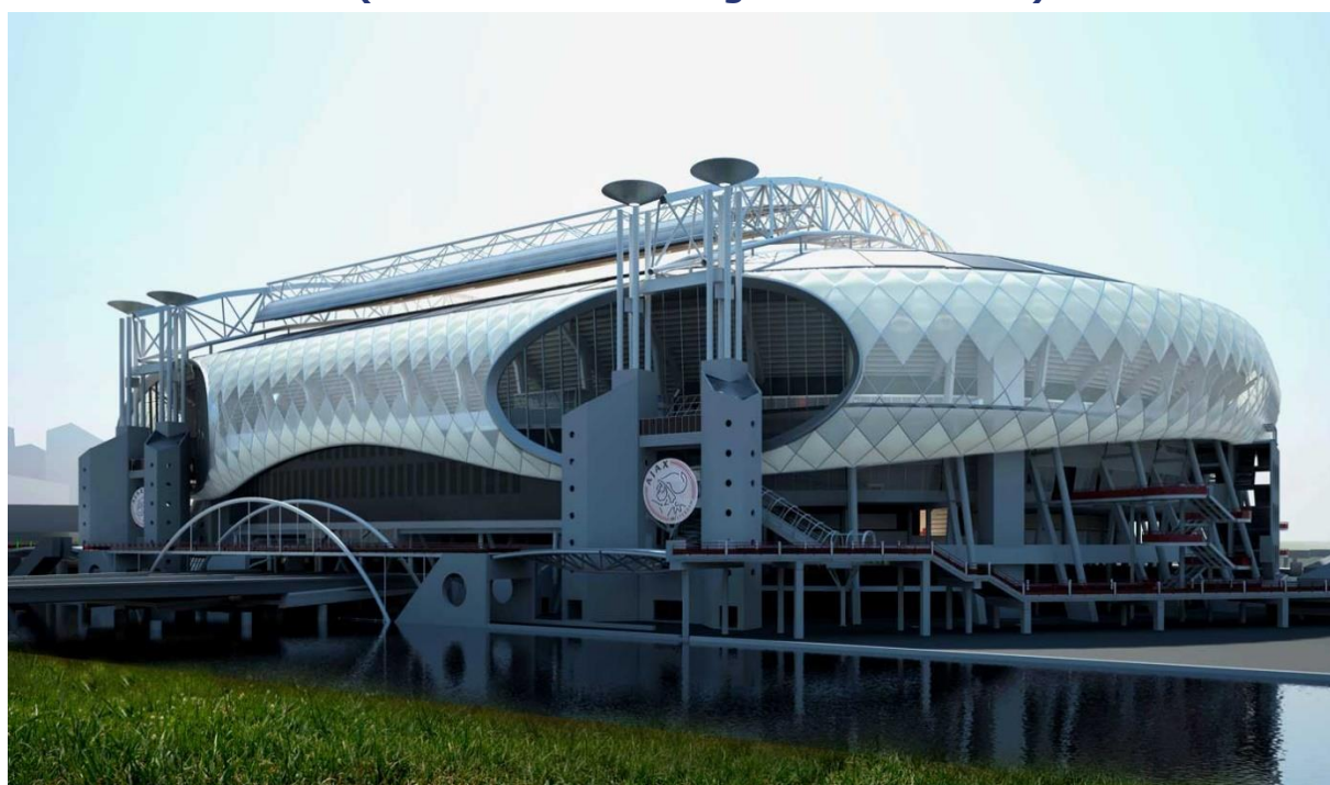
Stadium powered by more than 4,200 solar panels and a wind turbine.

The construction sector is closely related to more environmentally sustainable sport practices as the building and maintenance of sports facilities have a significant impact on the environment. The design and construction of sports facilities can affect energy consumption, waste production, and carbon emissions. The use of sustainable materials, the implementation of energy-efficient systems and the installations of renewable energy sources (such as solar panels, wind turbines or geothermal systems) can reduce the environmental impact of sport facilities. Moreover, sport facilities can reduce water usage